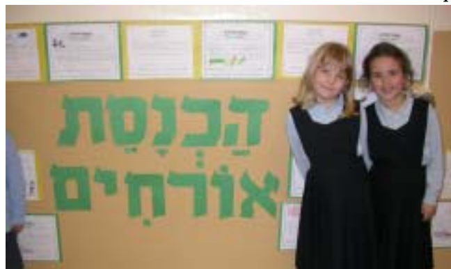
Kita Aleph learning about mitzvos through ksivah.